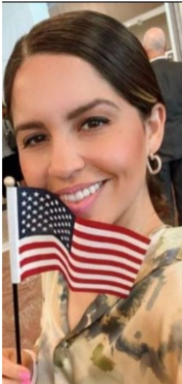
One of our Clinic participants who became a citizen last year!

Here's more info on our upcoming clinics in Austin, San Antonio and Waco.