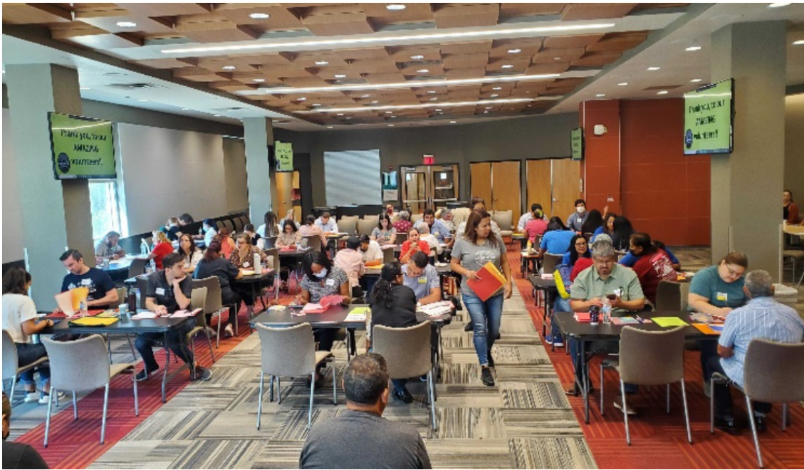
San Antonio Naturalization Clinic, 2022